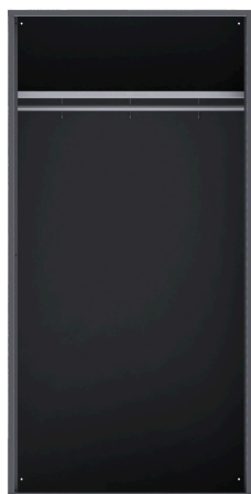
FRONT VIEW W/O DOORS