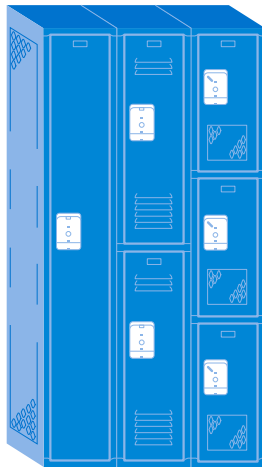
1, 2 & 3 TIER