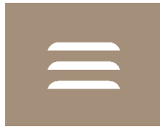
Gray Beige RAL1019