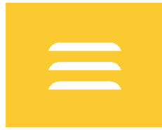
Zinc Yellow RAL1018