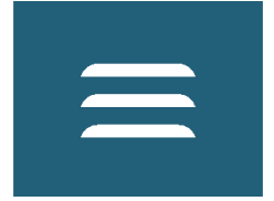
Azure Blue RAL5009