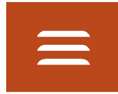
Red Orange RAL2001