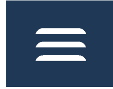
Sapphire Blue RAL5003