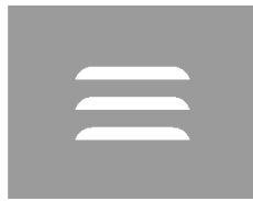
Signal Gray RAL7004