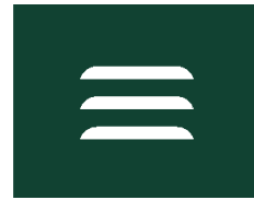
Moss Green RAL6005