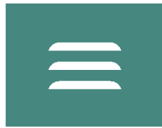
Mint Turquoise RAL6033