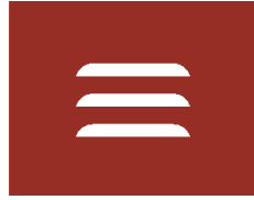
Tomato Red RAL3013