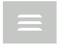
Light Gray RAL7035