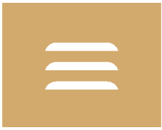
Sand Yellow RAL1002