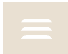
Gray White RAL9002