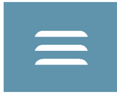
Pastel Blue RAL5024