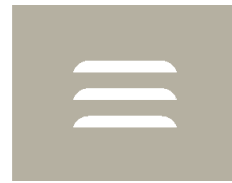
Pebble Gray RAL7032