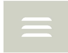
Papyrus White RAL9018