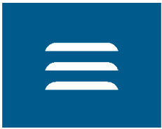
Traffic Blue RAL5017