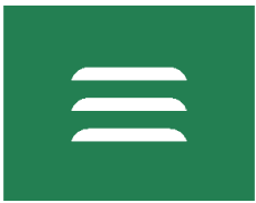
Signal Green RAL6032