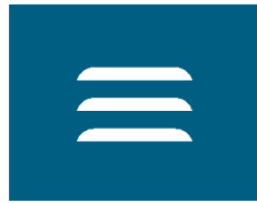
Capri Blue RAL5019