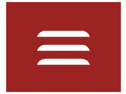
Carmine Red RAL3002