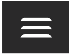
Traffic Black RAL9017