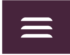
Purple Violet RAL4007