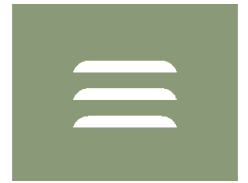
Pale Green RAL6021